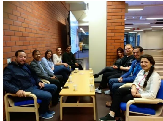
Picture 8. Project team members with the team of the host institution Eastern Finland University

The presentation also gave an overview of the stakeholders in Bosnia who have shown interest in the project. The method for extraction of the metal ions from the mining sludge from Omarska mine have been shown and discussion was performed on the subject of the metal analysis and their separation.