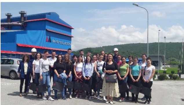
Picture 2. Project team, together with the students from Chemistry department in the visit of the “RS silicon” factory in Mrkonjić Grad.

ADDITIONAL VALUE TO THIS ACTIVITY: From the budget for local travel, the project team have realized also visits to the 3 factories, potential stakeholders of the projects realized by project team, and the best students from Chemistry Department were also involved in these activities.