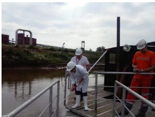
Picture 1. Project team performing sampling of the waste sludge in the Omarska iron mine

Since the first step in the project development was the study of the quality of the mining sludge, in order to extract as many useful metal ions as possible, the project team has visited the largest iron mine in Bosnia and Herzegovina. It is the Omarska iron mine in vicinity of the Prijedor city. The deposits here are estimated up to 100 million tons of iron. The ore type is limonite which is known to produce plenty of the sludge and products other than iron.