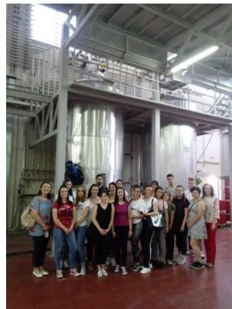
Picture 3. Project team with students during the visit to the “Tehnosint” company in Laktaši

The company will follow the progress of the project in hopes that the hybrid activated carbons produced through the project could one day also be tested for the removal of the toxic metal ions or carcinogen hydrocarbons from the used oils. The company is developing the line for recycle of the used motor and lubrication oils, the first one in Bosnia and Herzegovina. The project members have got guarantees for the access to the factory laboratory premises if needed for any kind of testing. The instrumentation in the laboratory is the state-of-the-art characterization equipment with highest safety standards and the laboratory is currently in the process of accreditation.