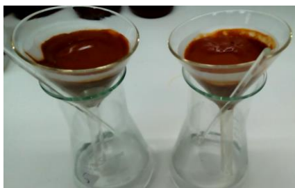
Picture 5. Separation of the iron from other metals of the mining waste extract

Performed timely, the ionic solutions of the iron and manganese in high concentrations obtained, the detailed analysis of other metals performed at the sub-contracting national accredited laboratories. The results have shown that the mining waste indeed contains mostly iron, however, also a high level of the manganese concentrations too. They are followed by the silica and also by the traces of the lead and aluminium.