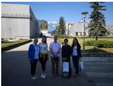
Picture 12. Team members visiting pharmaceutical factory "Bosnalijek", Sarajevo

The team members visited also the leading pharmaceutical factory in Bosnia and Herzegovina "Bosna Lijek" located in Sarajevo. The engineers and factory management informed them about the production process and the chemical laboratory for quality control of raw materials and finished