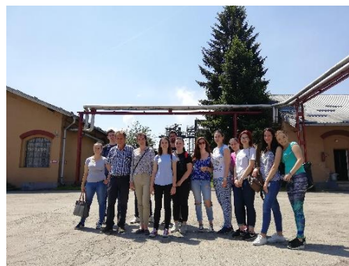
Picture 4. Project team and students with the engineers in “Destilacija” factory

The project team has collected the samples of the half-pyrolyzed samples from the factory for the future work. The Raman spectroscopy of the samples have shown pronounced G-band in the material, indicating that the graphene phase in this material is more dominant. This means that material should have good mechanical properties and therefore potential for multiple regeneration after application in the filtration processes. The project team included this material as one to be used in the series for preparation of the hybrid activated carbon to be enriched with metal ions from the mining sludge, since the main material is exclusively Bosnian cellulose material as the project goal demands.